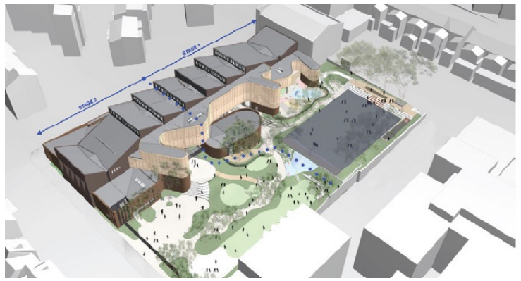
Photo 1| Darlington Public School - Artist's Impression from above

Client: FJMT Architects Year: 2018 - 2023 Location: Darlington, NSW Budget: N/A Area: N/A Year Levels: P-6 Students: 800 Architect: FJMT Architects